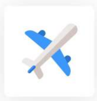
Railway stations and airport