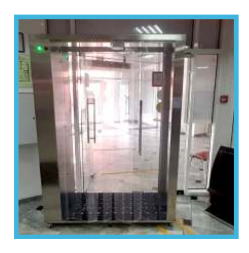
Entrance to Multifunctional Center for the Provision of Public Services, Solnechnogorsk