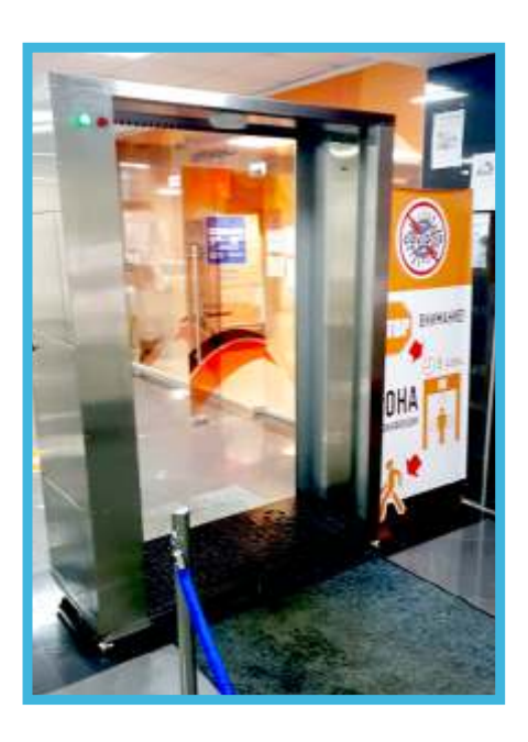
Administrative building, Ulyanovs