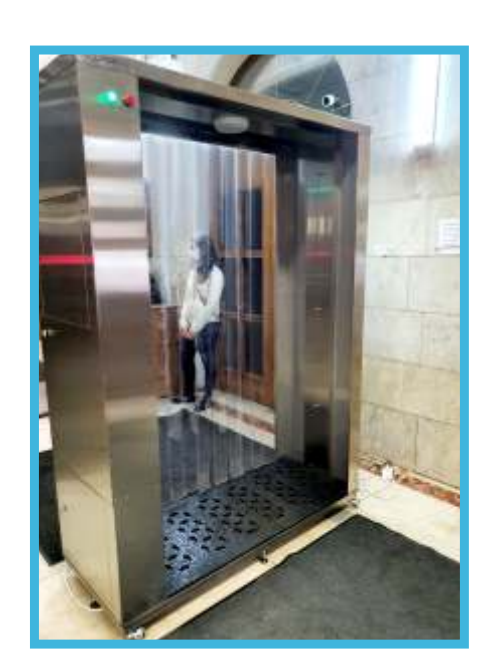
MADI entrance checkpoint, Moscow