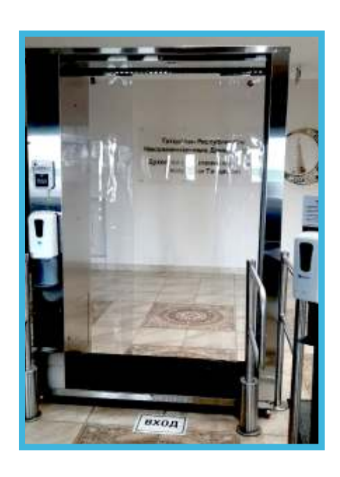
Muslim Spiritual Directorate of Tatarstan, Kazan