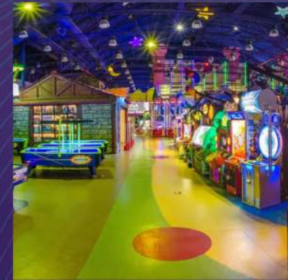
Attraction in an Amusement Park