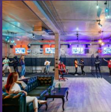
Attraction in a VR Park