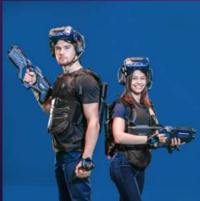
Whole Separate Business

Use our games in different ways; it can be either an independent venue, or a part a bigger VR club.