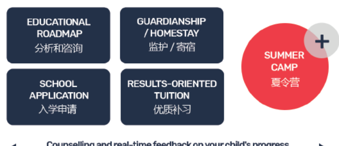
_ Counselling and real-time feedback on your child's progress ____ 为您的孩子 提供辅导和 定期学习反馈

Beyond handling the administrative burden of school applications and tuition, it also helps to ensure the psychological well-being of foreign students through guardianship and counselling.