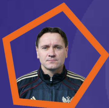
Dmitry Alenichev Ex-Head Coach of FC Spartak Former Player of the Russian National Team

«Championika has worked out very good methodics to work with children. It helps to develop kids since 3 years. The most important thing for kids is to love sport in this young age, so they would be strong and athletic»