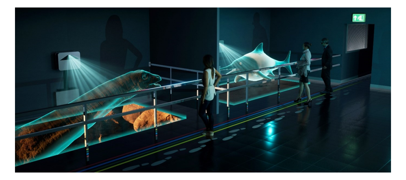
As well as going into hologram tunnels, the guests also go past smaller hologram enclosures with animals that move and act alive.